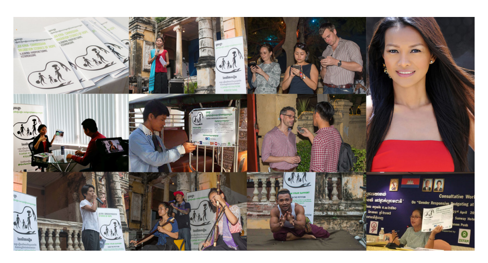
These are scenes of the JuiKnia, Cambodia – Migration Stories of Hope campaign, which gathered 47,685 signatures

were deaf, mute, victims of polio and landmine accidents, widows, or young children who were unskilled and needed to establish livelihood.